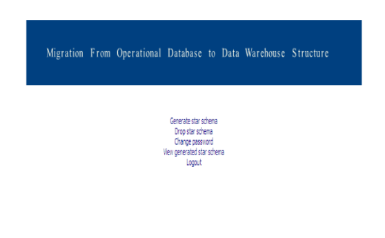
Figure 3: User Page

After log in to the system it will appear the main menu for the converting system that has Generate Star Schema, Drop Star Schema, Change Password, View Generated Star Schema and Logout .The figure 3 shown all of these.